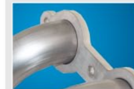
Our headers feature 3/4-inch flanges for maximum durability