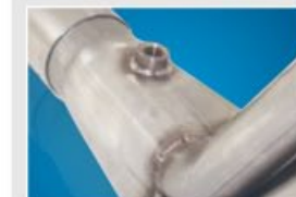
Our durable headers are CNC mandrel bent and tig-welded