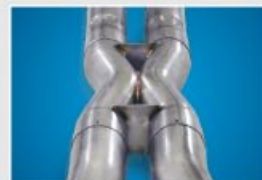
Includes x-pipe which increases performance through scavenging