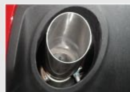
Our durable, polished tips made from Everlast 304L stainless steel