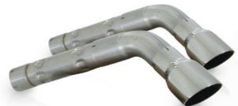
Our Retro-Chambered exhaust produces a deep muscle-car sound and has the look and style of the first generation Camaro