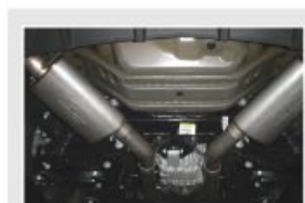
Our exhausts easily install to a factory connection point or custom SW headers

All of our Exhaust Systems are made in the USA and backed by our lifetime guarantee on material and workmanship.