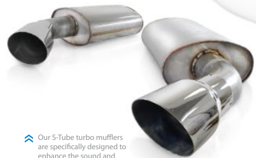
Our S-Tube turbo mufflers are specifically designed to enhance the sound and performance of your Camaro

Unlock the full potential of your new Camaro: introducing Stainless Works' Stainless Steel dual-exhaust system for the 2010 Camaro. Whether you are fitting to a factory connection point, or to custom SW headers, you will gain performance and turn heads with this mean-sounding system. Constructed with high-quality Everlast 304L stainless steel, our durable Catback Systems are formed with CNC mandrel bends and backed by our lifetime guarantee.