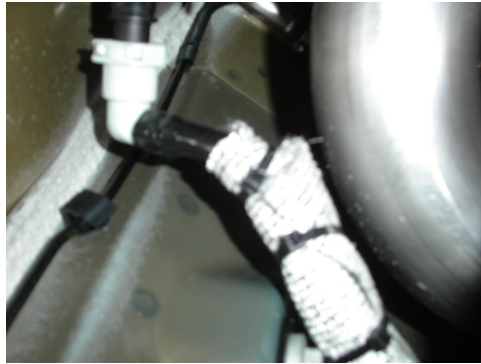
Wrapped EVAC Tube (picture #1)